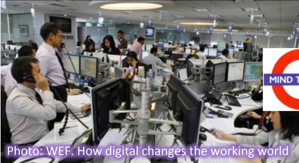
How digital changes the working world