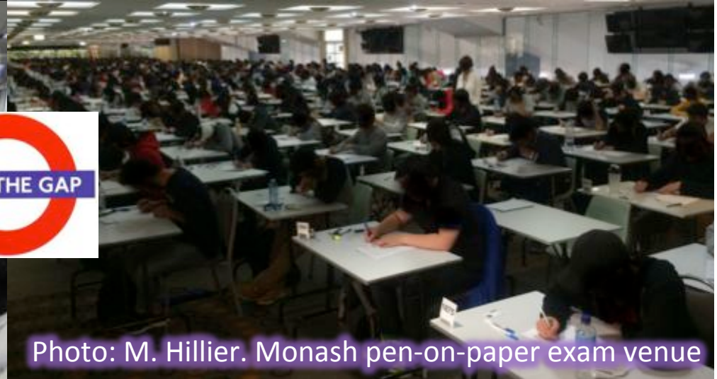
Monash pen-on-paper exam venue

Employers demand graduates skilled for the 21 st century characterized by ICT intensive workplaces.